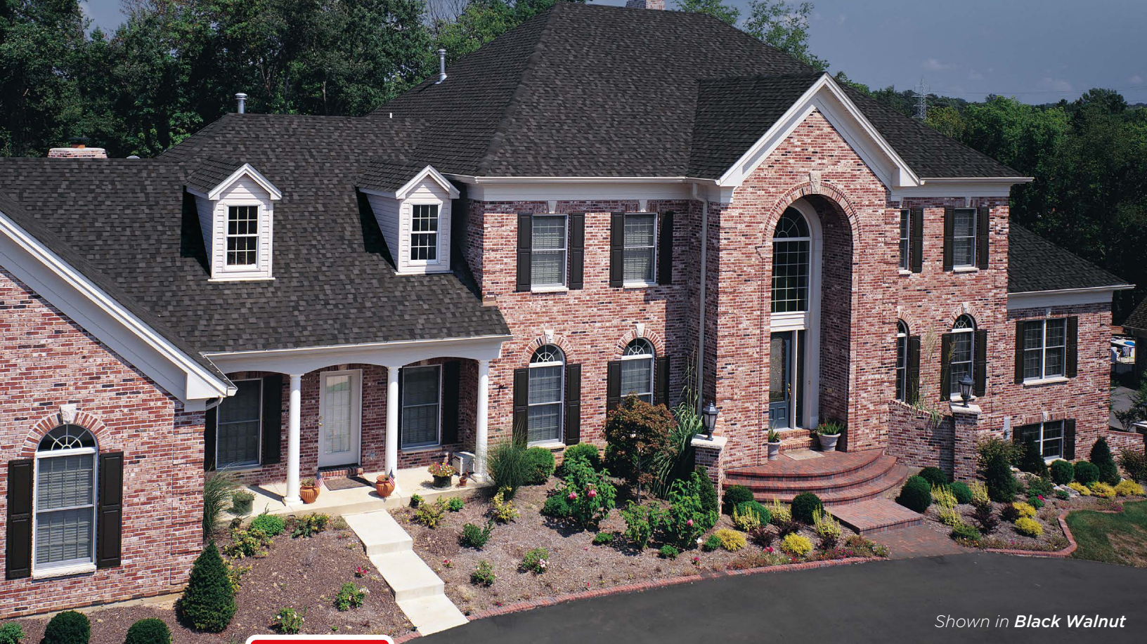
Shown in Black Walnut