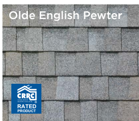
Olde English Pewter