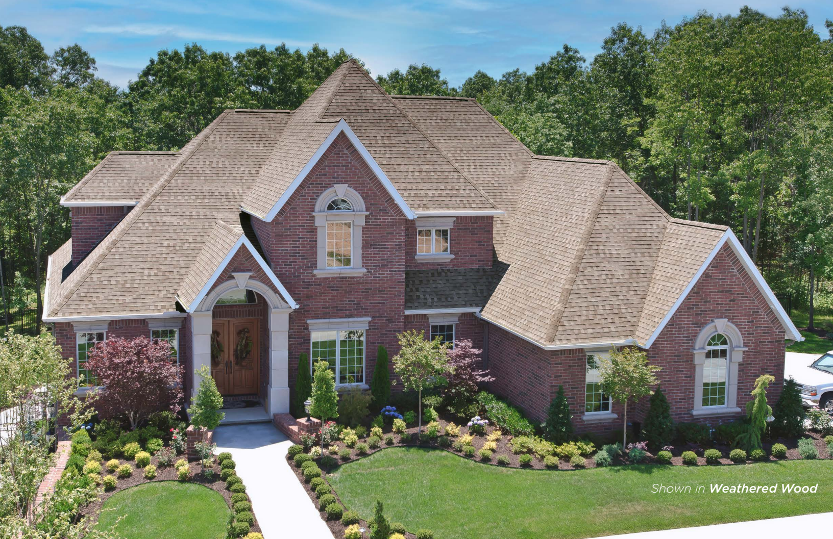
Shown in Weathered Wood